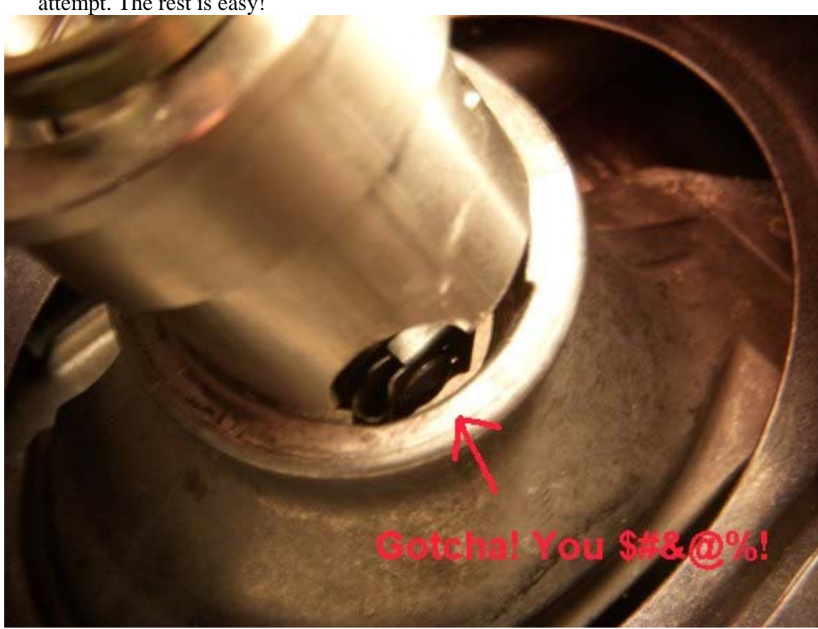
13. Push rags or paper around the shifter carrier so if you drop a screw it can't fall into the 'pit of no return' (trans heat shield-don't ask how I know this).