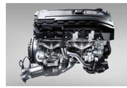
New top engine: the six-cylinder...