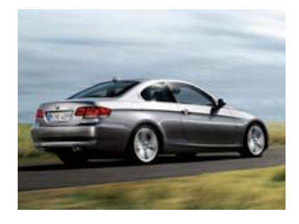
Perfectly tuned: the BMW 3 Series Coupé's chassis delivers a level of performance and agility that matches the car's dynamic looks.