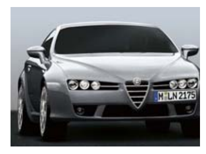
The new Alfa Brera Coupé – distinctive Italian style, but with weaknesses in terms of quality, interior space and fuel efficiency.

CLK 500 – solid presentation, but lacks sporting ability, being aimed at an older demographic.