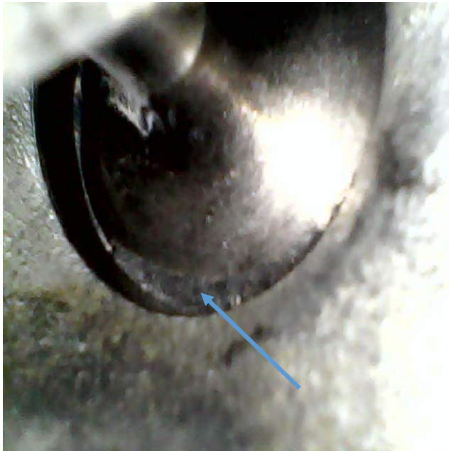
Clean valve with residual carbon “shadow”

The BMW Group Carbon Blaster pamphlet shows you what “clean” valves look like on page 19. Note from the valve on the left that there will remain a “shadow” of buildup at the front (just barely visible) and back of the valve where these areas are partly shielded from the walnut shells.