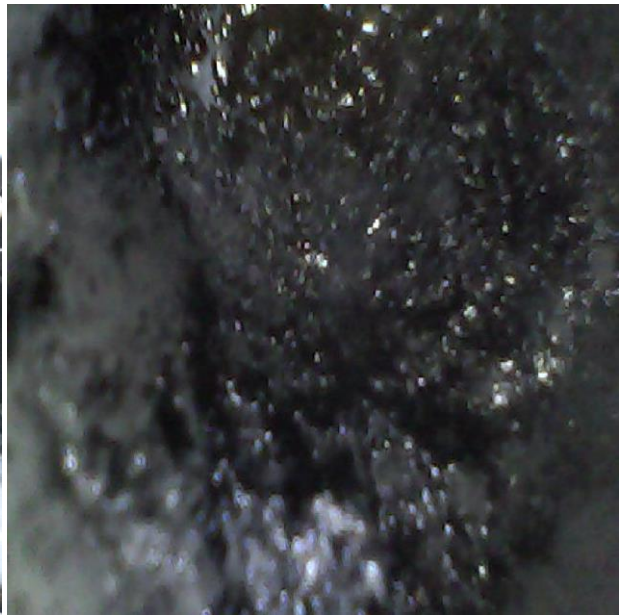
Left – caking inside intake runners in rocker cover. Right – yes, there is a valve in this photo!

Preliminary work is covered by BMW B 11 03 14 Preliminary Work Note that special tool 13 0 170 on page 10 is not required. Simply lift the lock (2 on the diagram) and the connection (1 on the diagram) will lift right up and the return line will pop off the injector.